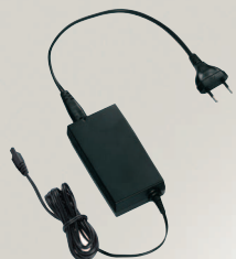
Adaptor kit ACK-600

The PowerShot A80 comes with a comprehensive range of accessories to help take your photographic skills even further. Here are just some of the optional accessories to choose from.