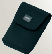
Soft Case SC-PS600