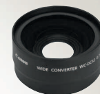
Wide converter lens WC-DC52

Allows you to capture exceptional close-up detail.