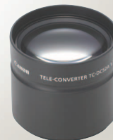
Tele converter lens TC-DC52A

Captures a wider angle making it ideal for group portraits, outdoor panoramas and interior shots.