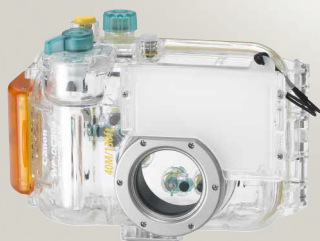
Waterproof case WP-DC900

Makes the PowerShot A80 fully functional up to 40 metres underwater. Large buttons can be easily operated, even when wearing gloves.