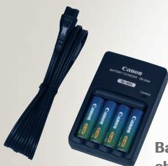
Battery charger CBK-100